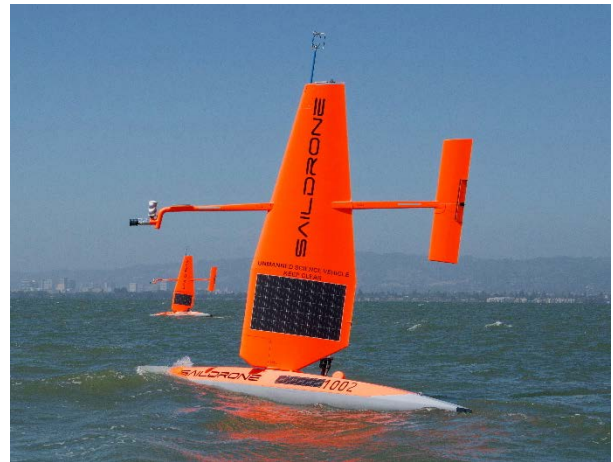
The unmanned surface vehicle, saildrone, to be used to collect environmental data in the Gippsland region.

The final aspect of the research will develop numerical modelling tools that can be used for environmental prediction.